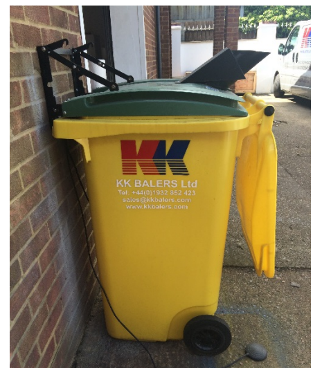
Wall Mounted Option